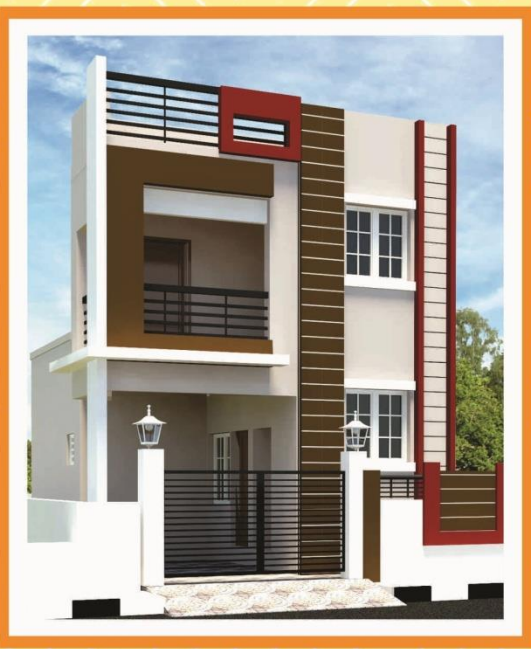
Model 3 LAND AREA : 645 Sq.Ft BUILD AREA : 870 Sq.Ft