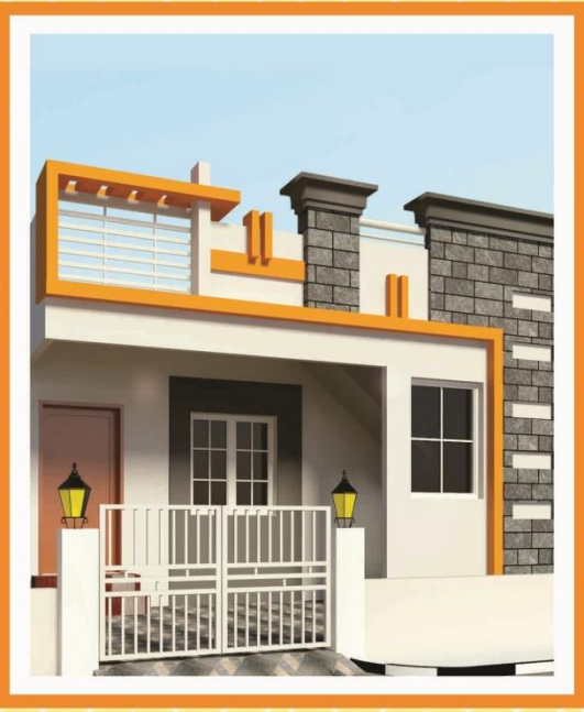
Model 4 LAND AREA : 1161 Sq.Ft BUILD AREA : 717 Sq.Ft